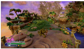
Skylanders Trap Team – Moving Volumetric Clouds and Atmospheric Effects