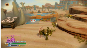
Skylanders Trap Team – Undead Spawner and Atmospheric Effects