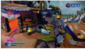
Skylanders Trap Team, Bubble Chimney and Atmospheric Effects