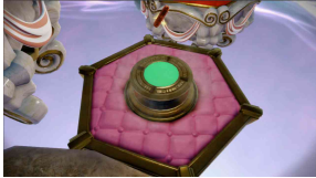
Skylanders Trap Team – Button Dust and Atmospheric Effects