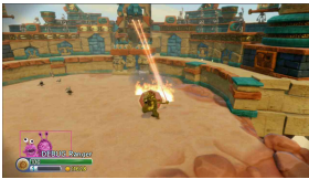
Skylanders Trap Team – Boss Battle Laser Beams and Ground Fire