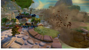
Skylanders Trap Team, Bridge Destruction and Atmospheric Effects