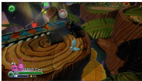
Skylanders Trap Team – Log Jammer smoke and Sparks and Atmospheric Effects