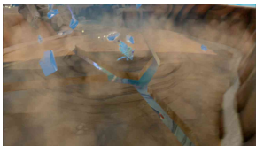
Skylanders Trap Team, Breaking Ground Dust and Atmospheric Effects