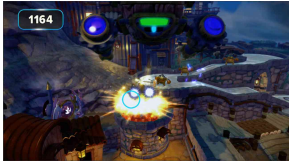
Skylanders Trap Team, Turret Explosions, Smoke Stacks, Chimney Steam and Atmospheric Effects