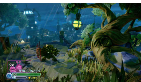
Skylanders Trap Team – Rain and Rain splashes and Atmospheric Effects