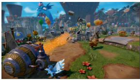
Skylanders Trap Team, Soda Cannon and Atmospheric Effects