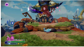
Skylanders Trap Team, Evil Persephone Magic Beam and Atmospheric Effects