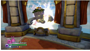
Skylanders Trap Team, Magic Statue Reveal and Atmospheric Effects