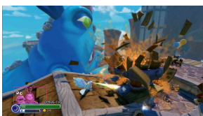
Skylanders Trap Team, Soda Barrel Destruction and Atmospheric Effects