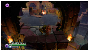
Skylanders Trap Team, Internal Statue Fires, Platform Dust and Atmospheric Effects