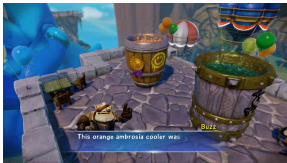
Skylanders Trap Team – Orange Ambrosia and Suction Eel Flavored Soda Bubbles and Atmospheric Effects