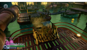
Skylanders Trap Team – Bridge Roll up Dust and Atmospheric Effects