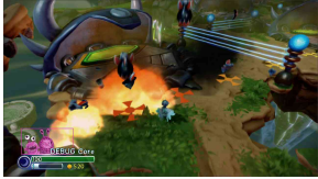
Skylanders Trap Team, Bomb Explosions