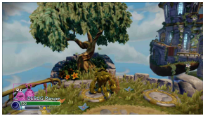
Skylanders Trap Team, Falling Leaves, Bees and Atmospheric Effects