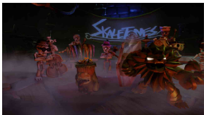
Skylanders Trap Team, Fog Machine and Atmospheric Effects