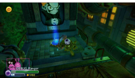
Skylanders Trap Team – Stink Fumes and Atmospheric Effects