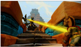
Skylanders Trap Team – Golden Queen Beam and Gold Statue Transformation and Atmospheric Effects