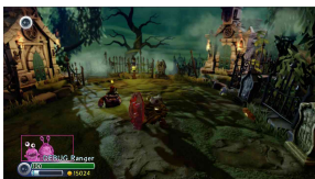
Skylanders Trap Team – Exterior Torch Variant and Atmospheric Effects