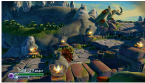
Skylanders Trap Team, External Statue Fires and Atmospheric Effects