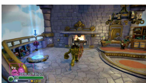
Skylanders Trap Team – Fireplace Variant and Atmospheric Effects