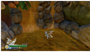
Skylanders Trap Team, Soda Bubbles, Waterfall Bottoms and Atmospheric Effects