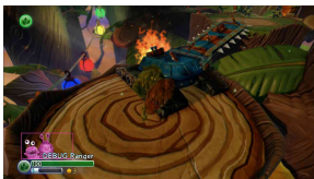
Skylanders Trap Team, Log Jammer Fire and Atmospheric Effects