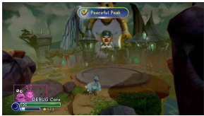
Skylanders Trap Team, Blowing Dust