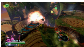
Skylanders Trap Team – Log Jammer Explosion and Atmospheric Effects