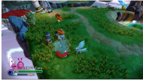
Skylanders Trap Team – Dreamland Sparkle Vents and Atmospheric Effects