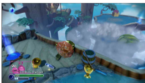
Skylanders Trap Team, Cloud Vortex and Atmospheric Effects