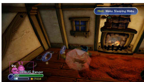
Skylanders Trap Team – Fireplace Variant and Atmospheric Effects