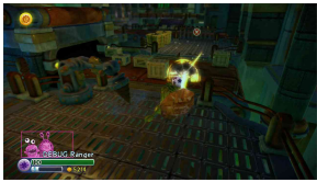
Skylanders Trap Team, Crate Destruction and Atmospheric Effects