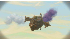
Skylanders Trap Team – Flynn Ship Exhaust Smoke