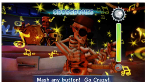
Skylanders Trap Team, Musical Note Explosions and Atmospheric Effects