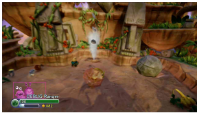
Skylanders Trap Team, Steam Plug, Vent and Atmospheric Effects