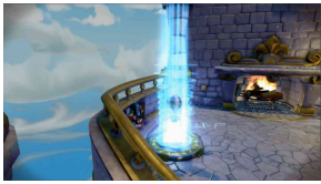
Skylanders Trap Team, Teleporter, and Atmospheric Effects