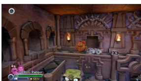
Skylanders Trap Team – Interior Torch Variant and Atmospheric Effects