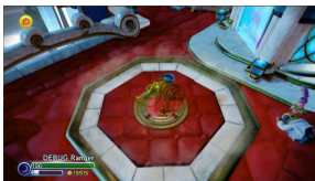
Skylanders Trap Team – Platform Dust and Atmospheric Effects