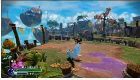
Skylanders Trap Team, Soda Bubbles and Atmospheric Effects