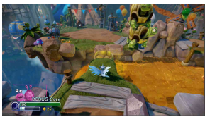
Skylanders Trap Team, Turtle Splash, Soda Bubbles and Atmospheric Effects