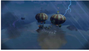
Skylanders Trap Team, Lightning and Rain