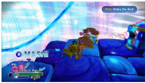
Skylanders Trap Team – Dream Stream and Atmospheric Effects