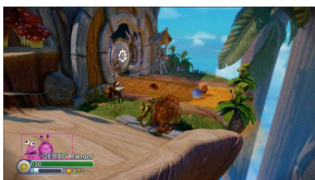
Skylanders Trap Team, Soda Bubbles, Waterfall Top and Atmospheric Effects