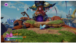
Skylanders Trap Team, Evil Purple Portal and Atmospheric Effects