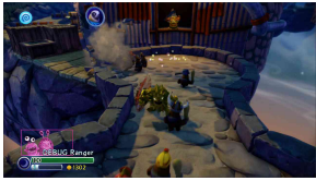
Skylanders Trap Team, Destruction Smoke and Atmospheric Effects