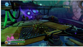
Skylanders Trap Team - Purple portals