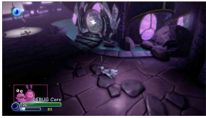
Skylanders Trap Team – Fireflies and Atmospheric Effects