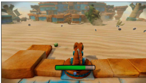
Skylanders Trap Team – Chompywurm dust and Atmospheric Effects