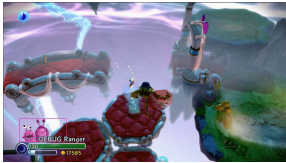
Skylanders Trap Team – Bubble Pop and Atmospheric Effects