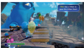
Skylanders Trap Team, Tower Bridge Impact Dust and Atmospheric Effects