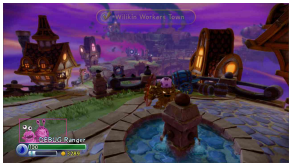
Skylanders Trap Team, Water Fountains, Splashes, Mist and Atmospheric Effects