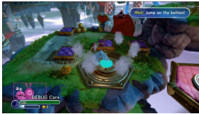
Skylanders Trap Team – Button Steam and Atmospheric Effects